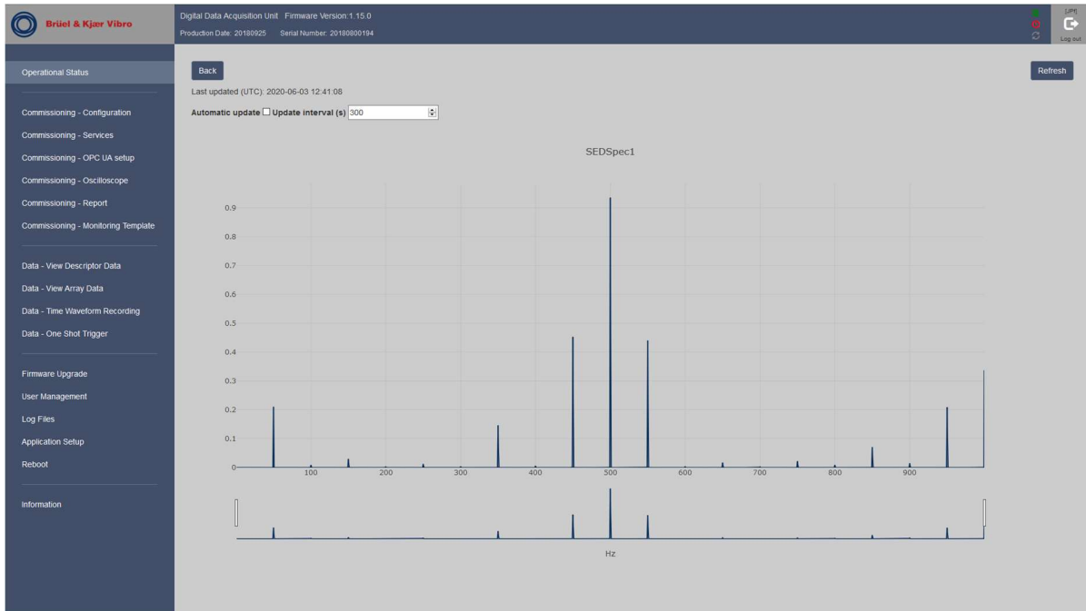
Figure 3 VCM-3 Homepage: Data – View Array Data (Example: Envelope spectra (SED) derived from acceleration enveloping descriptor “ECU”)